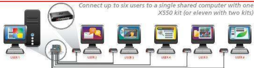
X550 & X350 PCI cards